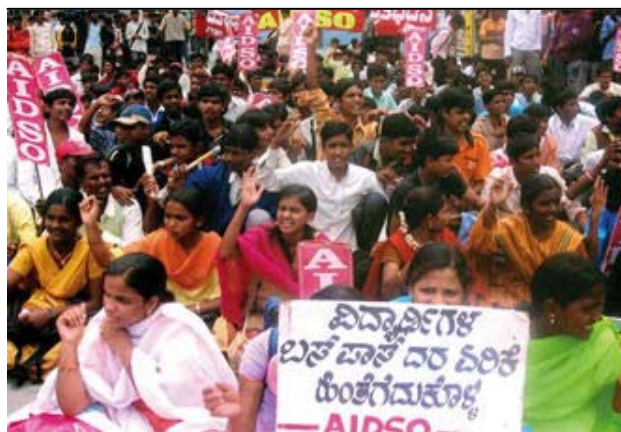
AIDSO organized movement against steep hike in students' bus fare in Karnataka and compelled the government to partially cut the hike. Above a portion of protest demonstration on July 7

transformation, it is imperative that the people of the capitalist-imperialist countries are dawned upon the consciousness that unless they rise up, close their ranks and build up intense anti-Global Warming movement in their respective countries to force the governments to desist from any move to increase emission of GHG and instead take immediate necessary steps to prevent the Earth from being excessively heated, the very survival of human species may be in jeopardy. All such movements must also be properly co-ordinated. It is only on break up of such a worldwide organized movement that the ruinous Global Warming could be stemmed.