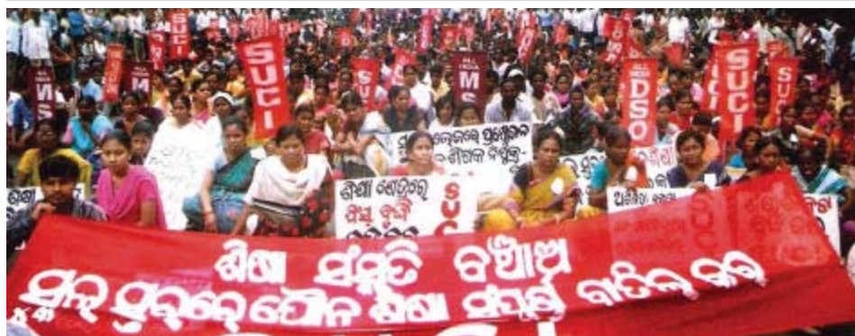
SUCI Orissa State Committee and its mass organisations held a massive demonstration in front of State Assembly on July 5 against sex education. A portion of the gathering is seen above