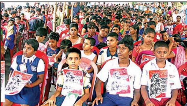
Children demand reintroduction of Pass- Fail System in PEDB sit-in

Please read 'water table' as 'water level' on first column on p. 2 and 41 st foundation anniversary as '51 st foundation anniversary' on p.6 in P Era dated 1 July, 2017. Mistakes regretted.