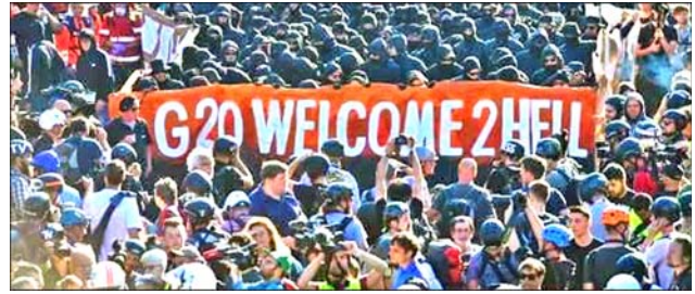
Massive demonstration against G-20 Summit, 2017, in Hamburg, Germany [News on page 4]