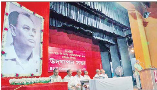
Observance of Party Foundation Day in Kolkata on 24 April evening and Patna, Bihar [below]