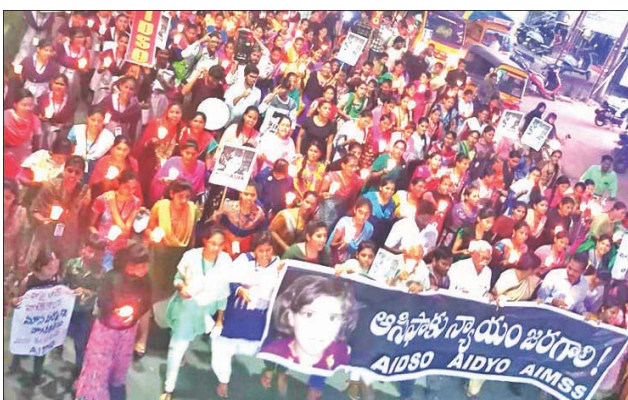
Part of Protest against Kathua and Unnao rape-murder incidents [from top] Bhiwani (Haryana), Chennai and Anantapur(AP)