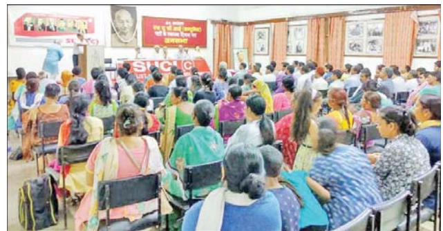
Audience at the meeting in New Delhi