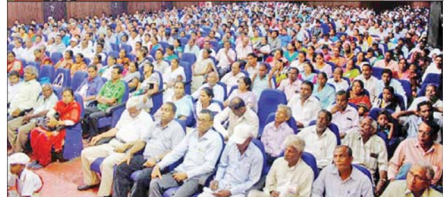
Observance of Party Foundation Day in Bhopal Madhya Pradesh [top] and in Cuttack, Odisha [two photos at the bottom]